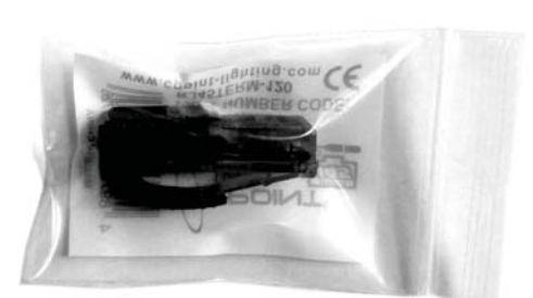
Height, max 13mm